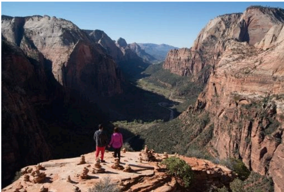
Angel's Landing at Zion National Park is one of many locations that allow the scattering of cremation ashes with a permit

https://www.nps.gov/arch/planyourvisit/memorialization.htm