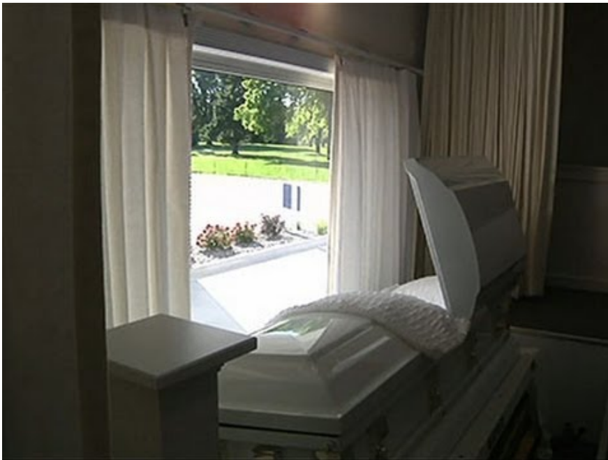
Paradise Funeral Home, Saginaw, Michigan

https://www.us-funerals.com/drive-thru-funeral-viewing/